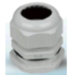
XLGA01-IN Waterproof Joint