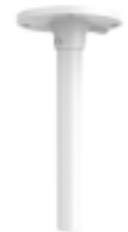
XLGCM24 Ceiling Mount