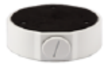
XLGJB03-H Junction Box